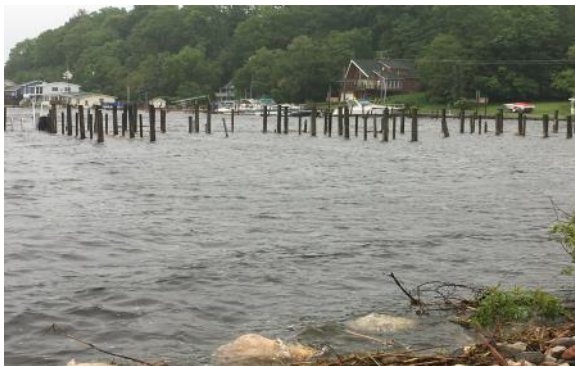
"Pirates Plank" docks by Longbridge are submerged.

The village budget includes $120,000 for maintenance of parks and recreation. An idea under exploration to offset that expense is the establishment of a seasonal RV park off Hammond Street where there is space for 140 sites.