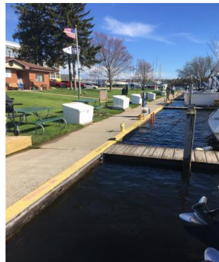
High water at the Village Marina